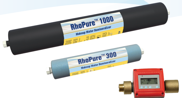
Optional RhoPure™ Meter